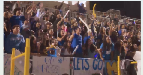
A recent photo from our student section, MARAUDER MOB, at our senior night game last Friday here at Mira Mesa