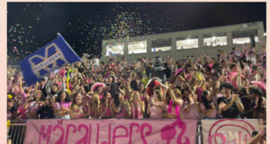
MARAUDER MOB DURING OUR HOME GAME AGAINST LA COSTA LAST FRIDAY WITH THE THEME BEING BARBIE