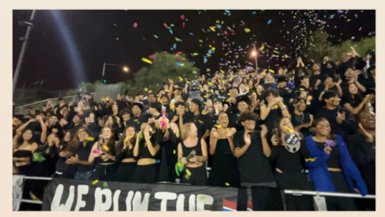
MARAUDER MOB AT SCRIPPS FOR THE ANNUAL BATTLE OF THE 15 RIVALRY GAME